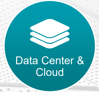
Data Center & Cloud

Scalable platform for data analysis, correlation, and visualization that enables actionable insights, real-time monitoring, and enhanced decision-making