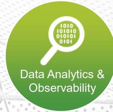
Data Analytics & Observability

Secure, integrated collaboration solutions to enhance team productivity, engagement, and user experience